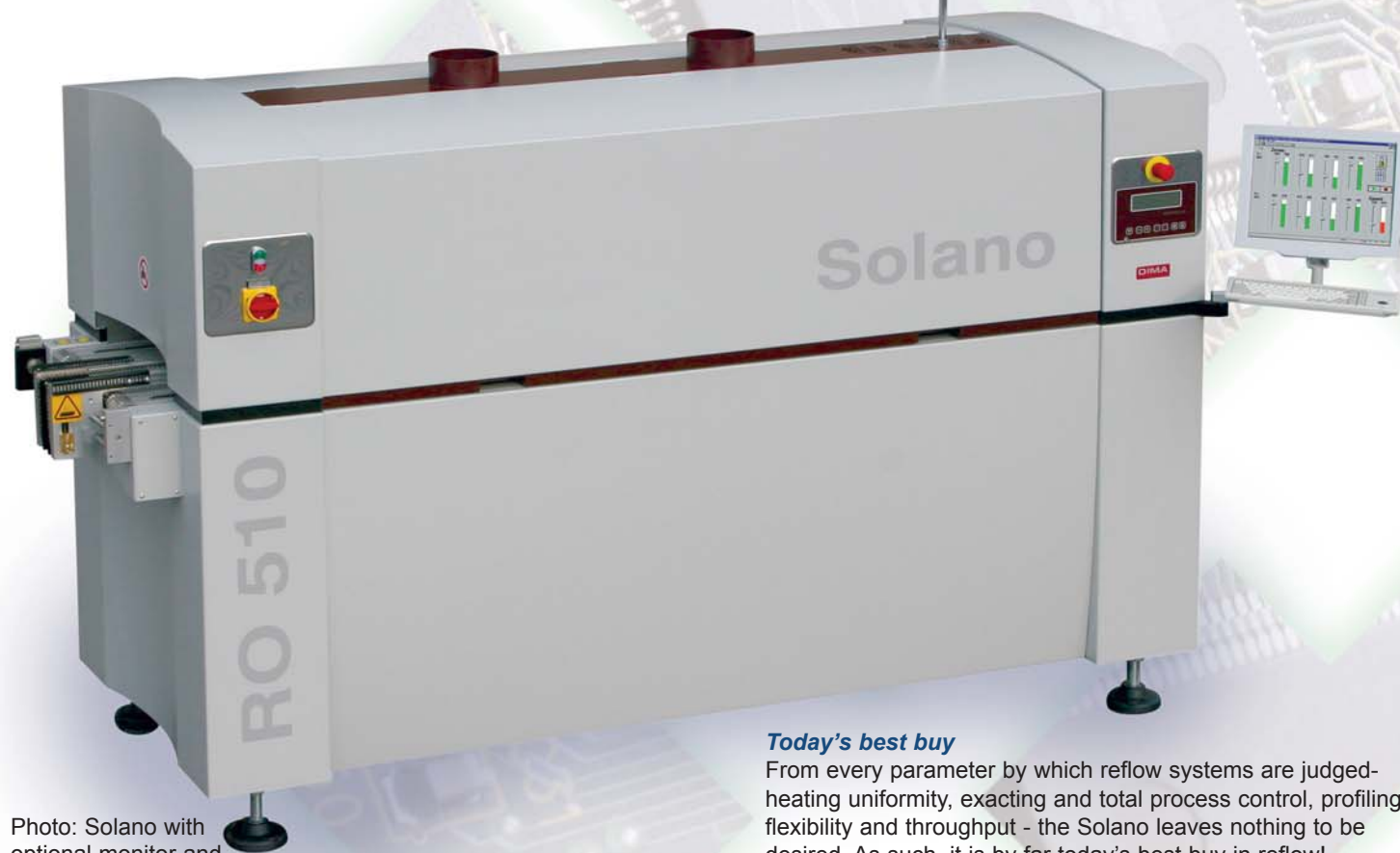
Photo: Solano with optional monitor and keyboard